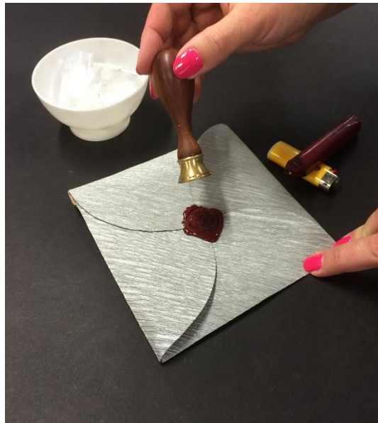
5) Pull the stamp away from the wax pool. You should now have a perfect wax seal. Leave it to cool for a further minute or so.