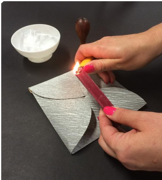
1) Hold the wax stick above the place you want the wax seal to be. Light the wick and allow the wax to drip.