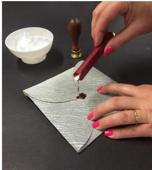
2) Allow the wax to drip in a pool that is a little smaller than the stamp head. The wax will spread out when your stamp is pushed into it.