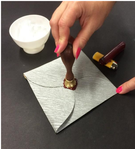
4) Gently press the stamp into the wax pool until you see the wax oozing out. Hold the stamp in place for 10-15 seconds to allow the wax to cool slightly.