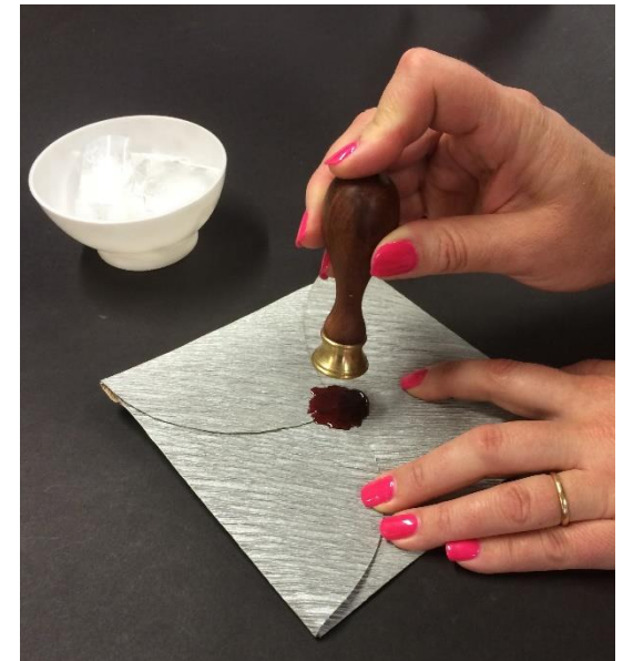
3) Position your stamp over the wax pool. MAKE SURE you have the stamp the correct way up and in the centre.